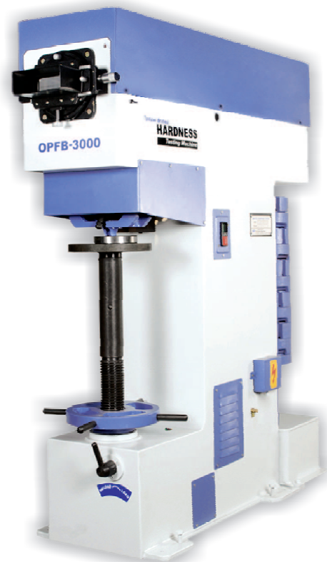
Model : OPFB-3000

FTM has developed Brinell Hardness Testing Machine with optical device. Basic machine design and operation is similar to TKB-3000, with built in optical device with 14X magnification provided in front to project diameter of ball impression on glass screen with a micrometer measuring system with 0.01 mm least count. In this machine the indenter swivels and projects diameter of ball impression immediately after unloading operation which avoids additional time for measurement of ball impression. This is a production testing machine. This is suitable for foundry, forging shops, heat treatment shops, engineering institutions etc.