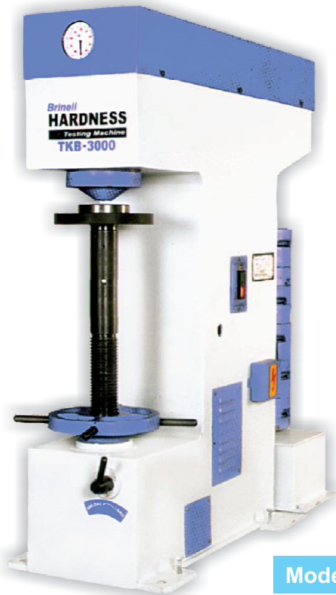
Model : TKB-3000